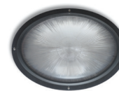
NSO OPEN (NSOO)