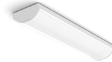
VIC Wide Series